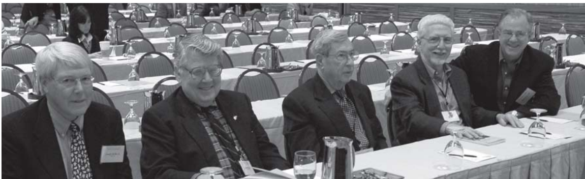
Some of the Past Presidents of the SAVS