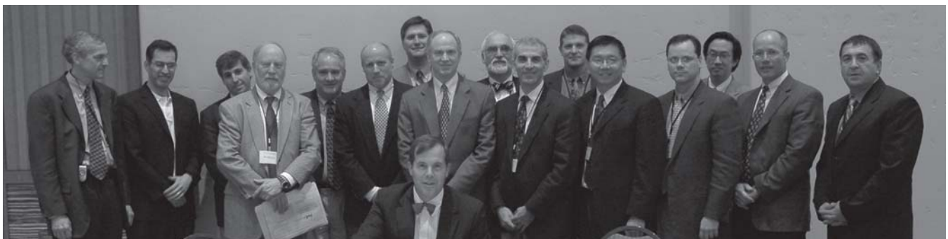
Mock Orals Examiners 2006