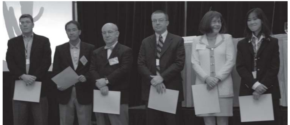
Some of the new SAVS members