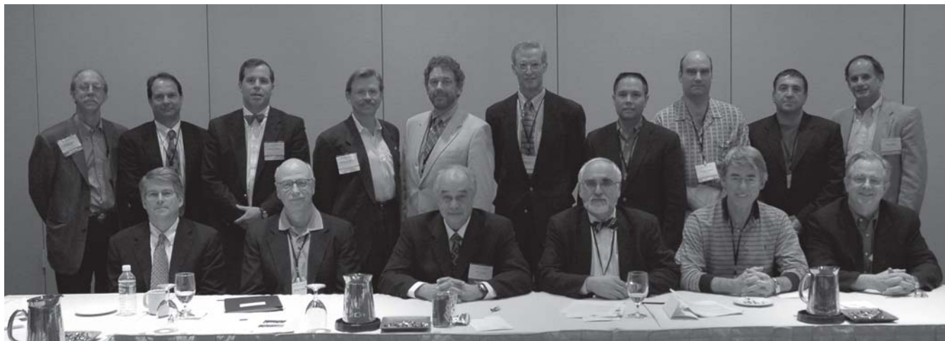
SAVS 2006 Executive Council