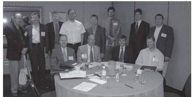
Mock Oral Examiners