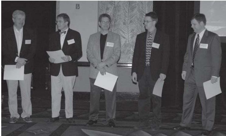
New Members of the Southern Association for Vascular Surgery