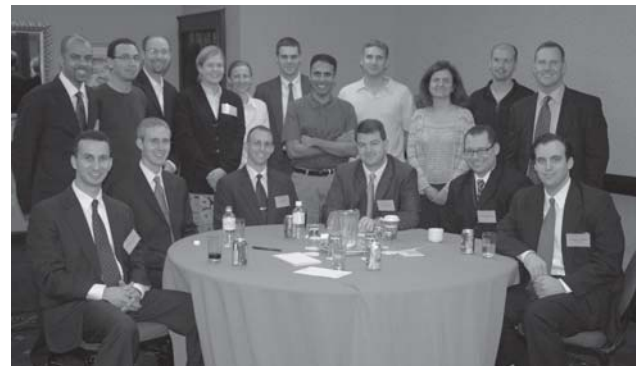
Vascular Resident Examinees